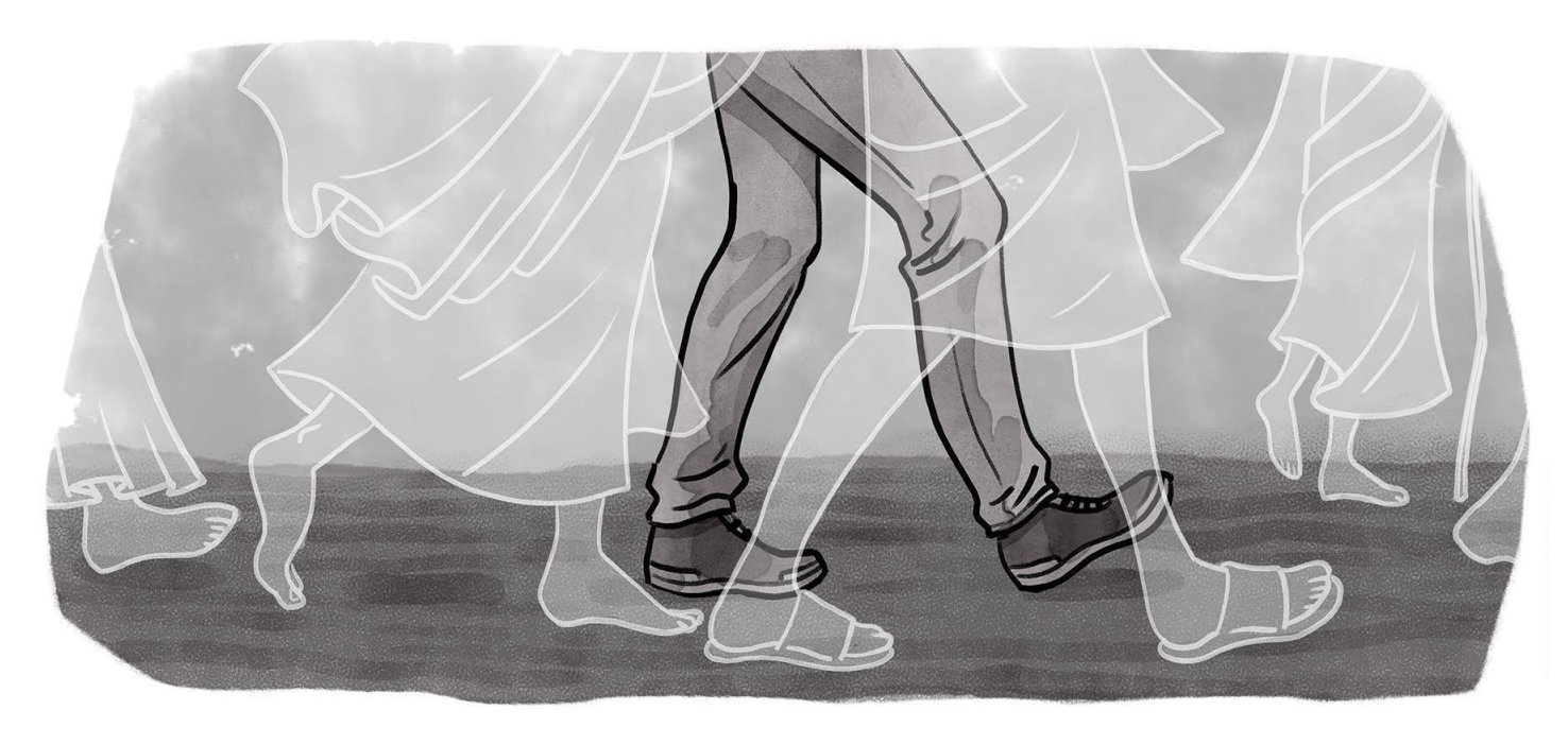
"Walking on the holy way, trod by the sages long ago."