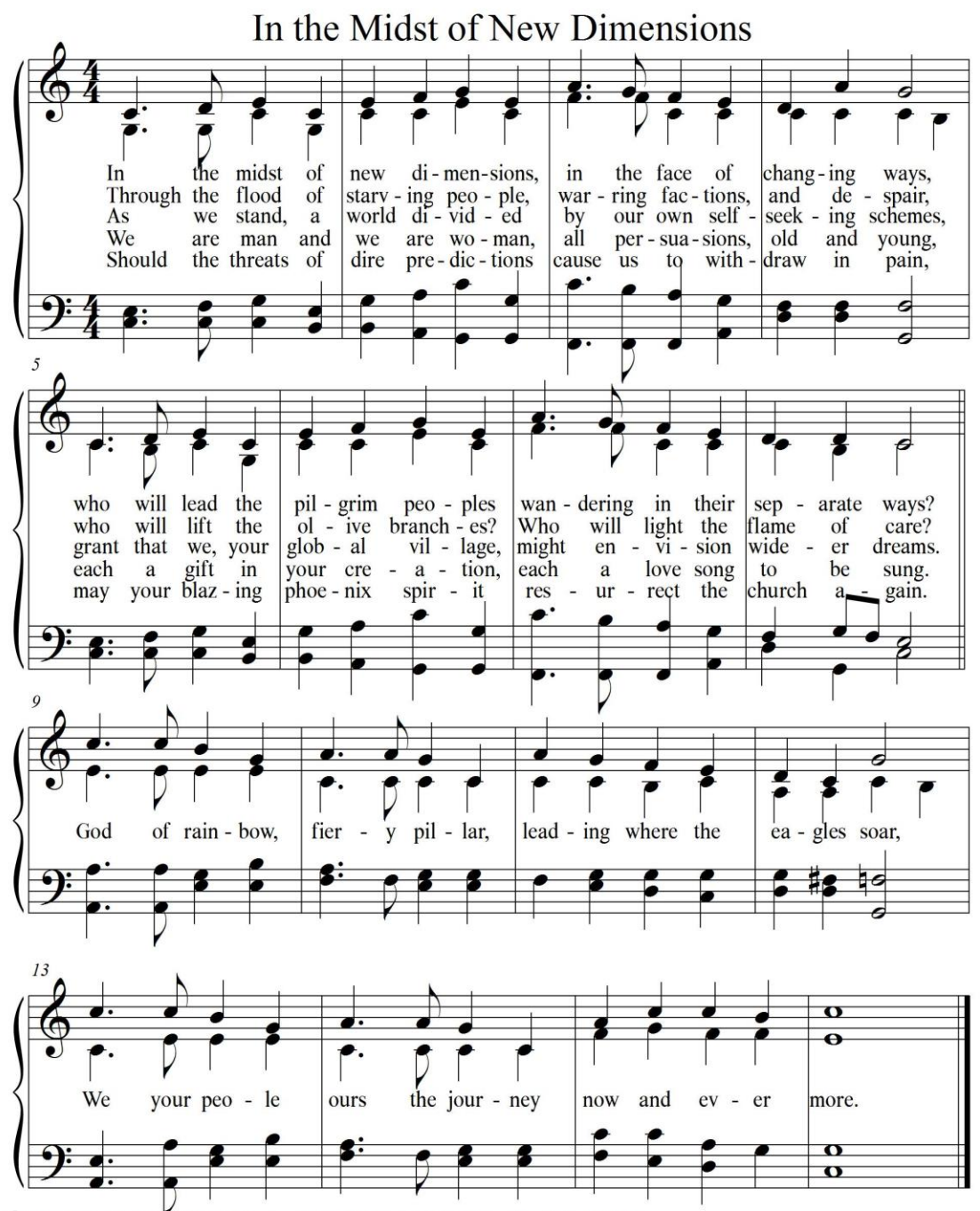
© 1979 Julian B. Rush. All rights reserved. Used with permission LicenSing Online #36770